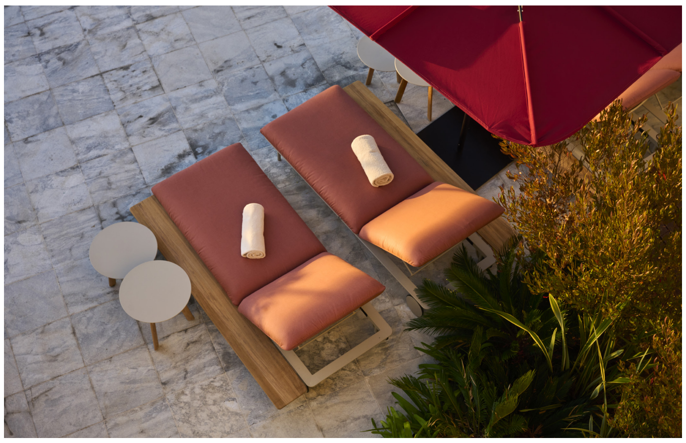
Four Seasons Ritz Lisbon, Portugal – Senja loungers with teak side table and Ile coffee tables