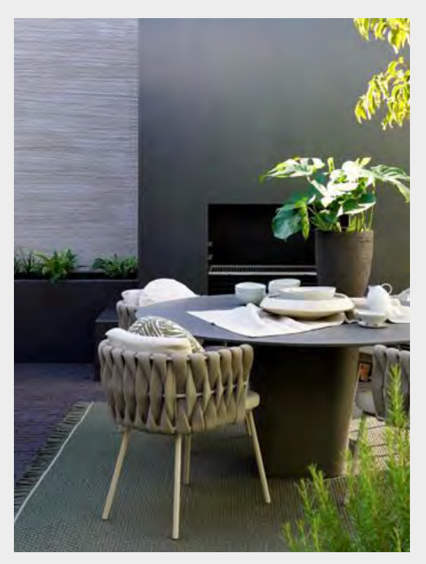
Residential Switserland Tosca armchairs - Tao dining table